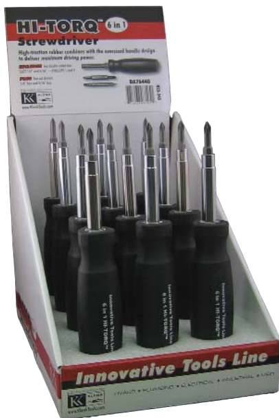
HI-TORQ™ COUNTERTOP DISPLAY/12